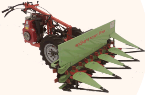
VARDHMAN 2 FD