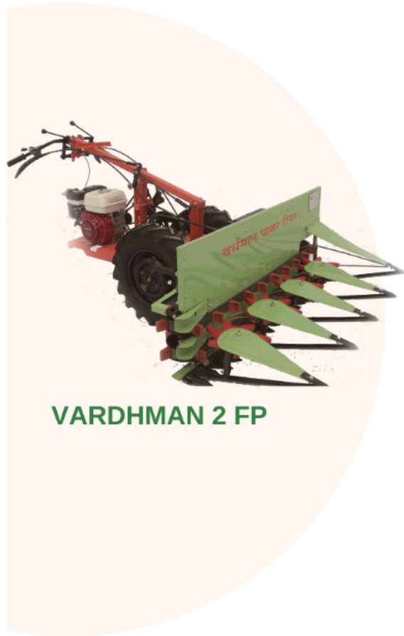
VARDHMAN 2 FP